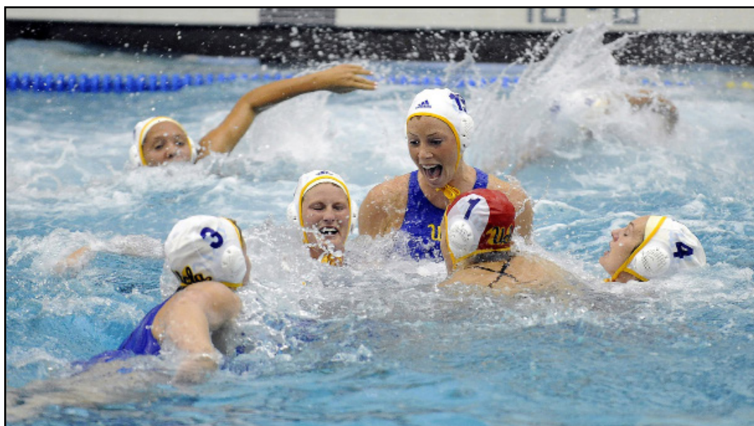
UCLA celebrates its 2009 NCAA Championship victory against USC.

For security purposes, the UCLA does not release to the general public any travel information for UCLA athletic teams. If you would like to reach a member of the UCLA water polo team on the road, please contact the Athletic Communications Office.